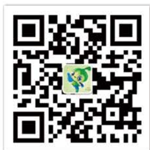
Twitter: Chongqing Ecology and Environment